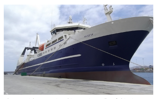
Photo 1. Fish processing ship "Navigator" – of shipping company Uftaskip.

In addition to such losses, there is the added argumentation of operating inside a quality management system and of international standards and legislations on trade such as for the European Economic Region that warrants a scrutinizing view on accurate, fair and proper filling of prepackages of any size. The advantages of fast weighing (PENKO instruments weigh at 1.600 samples per second) is faster throughput and less spillage, leading to fast ROI.