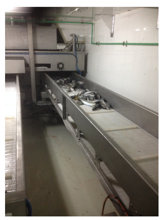
Photo 2. On board processing for the composition of batches of fish, build and installed by AFAK.