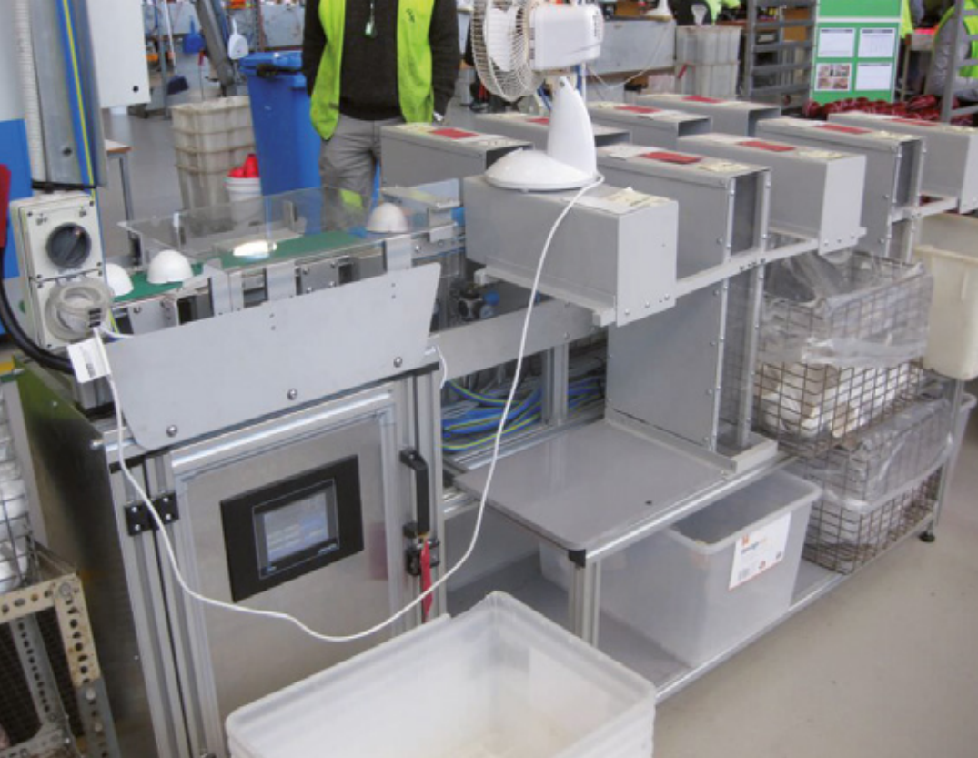
Sorting is based on weight measurement

Sustainability, legislative and regulatory changes and globalization: these are three topics having a lot of influence on the business operations of the sector, the Machevo & Bulk members say in the market report of 2016. It offers simultaneously opportunities. In addition to the development of new products (42%) they say to emphasize in particular on the far-reaching service (42%)