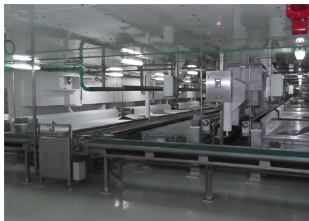
One of the conveyor belts built by Afak and fitted with weighing technology by PENKO

The Navigator is a factory trawler belonging to the fleet of the Icelandic shipping company Uthafsskip. At 121 metres long, it is one of the largest ships in its category.